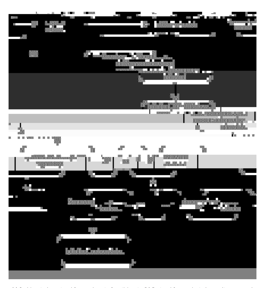
Fig re 1. (a) Scabies study protocol for enrolment of participants. (b) Protocol for nominated consultee approval.